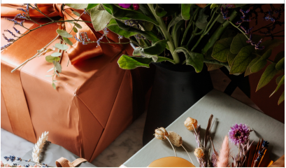
Full bleed banner Desktop: 1024 x 540 px Mobile: 375 x 250 px